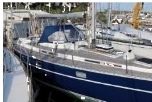
Side view starboard