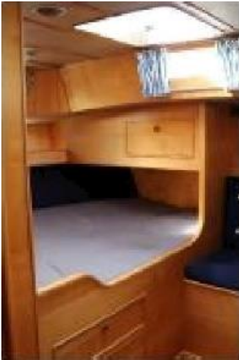
Double berth aft cabin