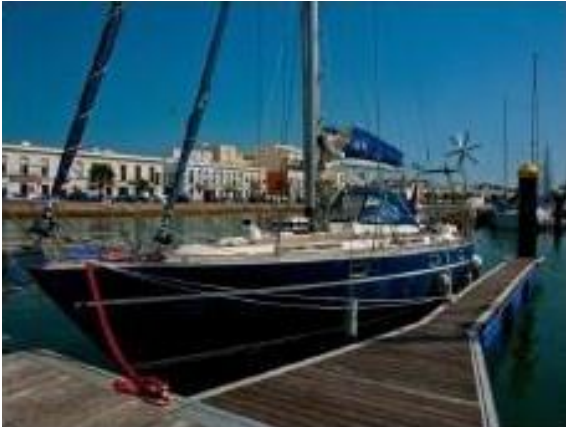
Side view port