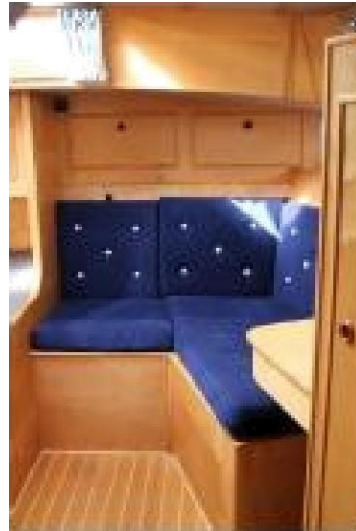
Cushion with drawer